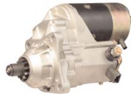
246-25162 12V, 2.8 kW, CW

Replaces Denso: 128000-248_, -312_ Blue Bird: 1760057 Cummins: 3920403, 643 Case I.H.: 1987586C1 J.I. Case: 181056, A187785