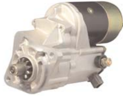
246-25110 12V, 2.8 kW, CW

Replaces Denso: 028000-678_ Allis Chalmers: 270324