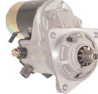
246-25118 12V, 2.8 kW, CW

Replaces Denso: 128000-178_, -303_ Teledyne: TMD27M-504, -506