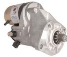
246-25132 12V, 2.8 kW, CW

Replaces Denso: 028000-840_ Bobcat: 6632415 John Deere: RE19275, 51447