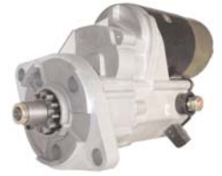
246-25214 24V, 4.5 kW, CW

Replaces Denso: 028000-754_, 128000-996_, 228000-019_ Komatsu: 600-813-1410, -1430