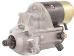
246-25112 12V, 2.8 kW, CW

Replaces Denso: 128000-408_, -8290 Caterpillar: 3E0079, 7C2264, 8T8619 John Deere: RE40092, 59595