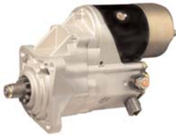
246-25108 12V, 2.8 kW, CW

Replaces Denso: 028000-601_, -602_ Toyota: 28300-22060-71, -32080-71