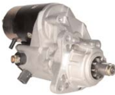
246-25109 12V, 2.8 kW, CW

Replaces Denso: 028000-745_, -781_ Toyota: 28100-31625-71, 28300-31960-71