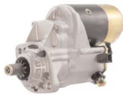
246-25111 12V, 2.8 kW, CW

Replaces Denso: 128000-106_ Caterpillar: 6T7001