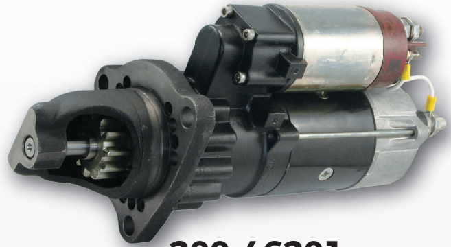
200-46201 24V, 7.2kW, 11T, CW, INS.