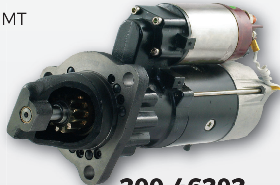
200-46202 24V, 7.2kW, 12T, CW, INS.