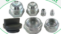
Oil line cap/plug kit

24V, 475A P/N: 1400-40290 97.0 Lbs / 44.0 Kg.