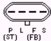
4 Pin Connection

Correction: Inspect the alternator and identify if it has the 2 pin connection or the 4 pin connection as shown below: